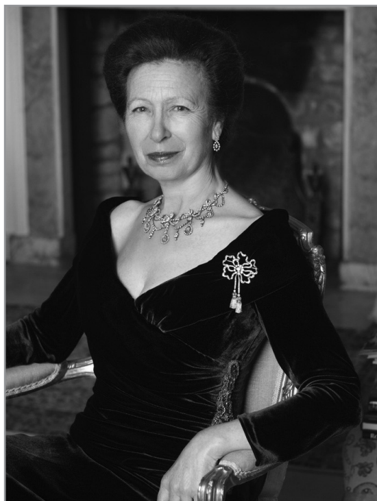
Her Royal Highness The Princess Royal - Patron of Townswomen's Guilds